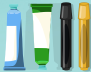
Acrylic paint/ Permanent markers